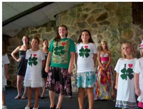
Kindred Spirit 4-H club members participate in the Fashion Show at the Wicomico Farm & Home Show.