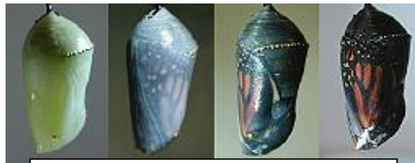
Adult Ready to Emerge From Chrysalis