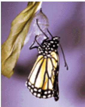
Newly Emerged Adult Pumping Up Wings