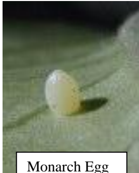
Monarch Egg on Milkweed

Butterflies go through Complete Metamorphosis: Egg, Larva, Pupa, Adult