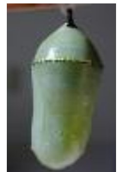
Pupa or Chrysalis