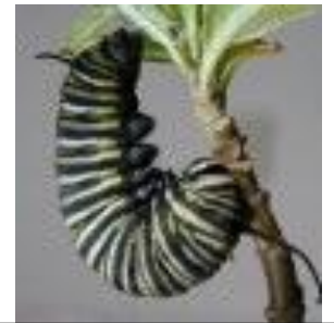
Caterpillar in "J" Position