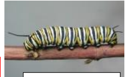
Fully Grown Caterpillar