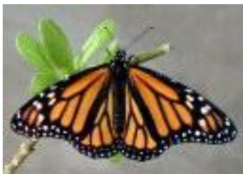
Adult Monarch Butterfly