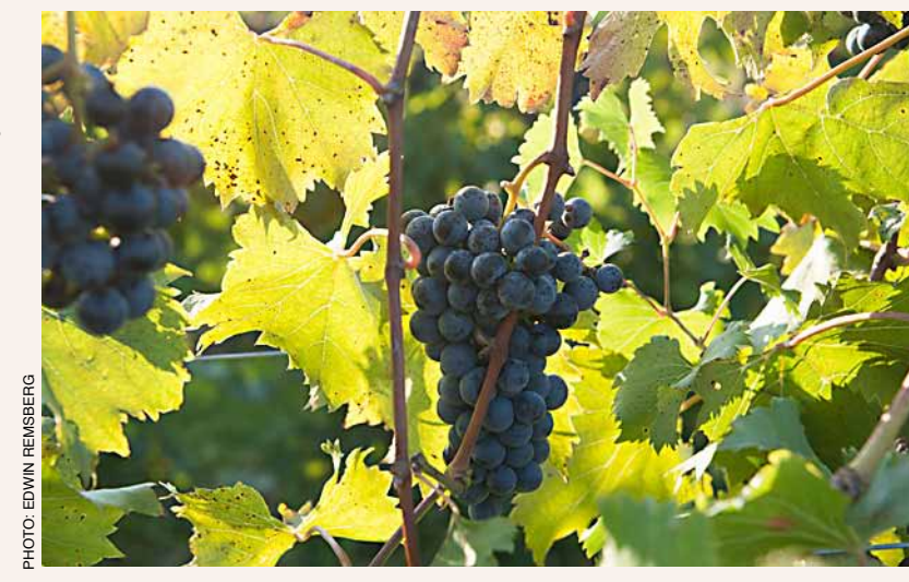
MARBIDCO's loan programs are designed to be utilized by those borrowers who may be short on equity and have insufficient collateral to be able to finance a purchase through conventional means, which is typical for a beginning farmer.

As discussed earlier, beginning producers will need to have developed a business plan before going to see lending officers at MAFC.