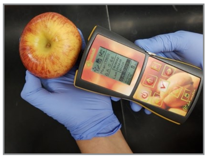
Figure 1. Using a DA meter to quantify the Index of Absorbance Difference ( I_{AD} ) which relates to the greenness and thus content of chlorophyll-a in the fruit skin.

The DA meter measures the Index of Absorbance Difference (I_{AD}) which relates to fruit greenness and thus to the content of chlorophyll-a in the fruit skin. The DA meter is a hand-held device that shines LED light into the apple and a sensor measures how much light reflects back. It can be used for fruit still attached to the tree, as well as detached fruits.