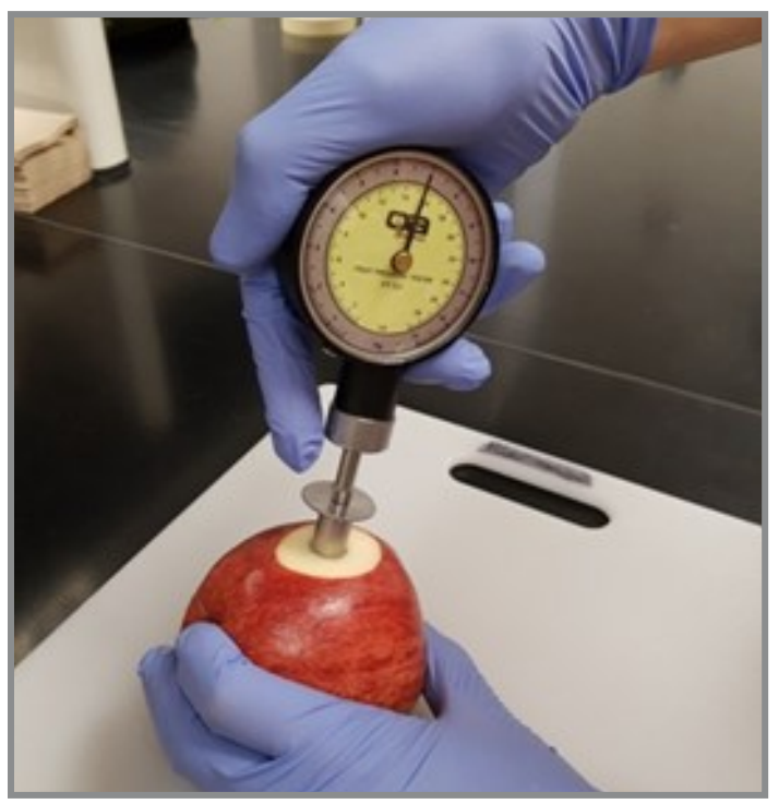
Figure 2. An Effegi firmness tester/penetrometer with a 7/16-inch diameter plunger used to measure firmness in one side of an apple.

Several factors can affect firmness readings. The presence of watercore (physiological disorder characterized by water-soaked areas of the apple's cortex which cause the tissue to become translucent), for example, will give erroneous higher readings. Fruit size