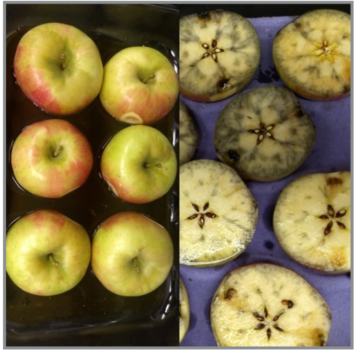
Figure 3. Result from conducting the starch-iodine test by applying iodine solution to the cut surface on an apple.

You can purchase ready-to-use iodine solution or prepare it by mixing 10 grams of potassium iodide and 2.5 grams of iodine crystals in 1 liter of water; stir for several hours until the crystals completely dissolve. Keep the iodine