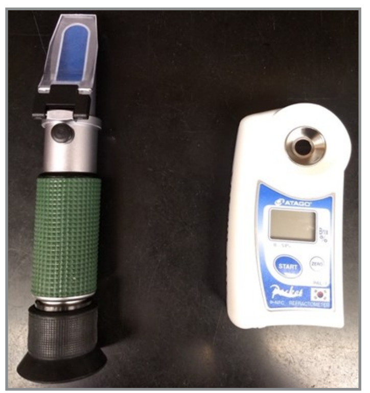
Figure 6. A hand-held manual refractometer (left) and digital refractometer (right) measure soluble solids contents of an extracted fruit apple juice sample.

Several factors can affect SSC readings which can make them highly variable and difficult to compare between seasons. SSC increases in fruit during years with high temperatures and more sunlight, due to increased photosynthesis. SSC decreases with excessive rain or