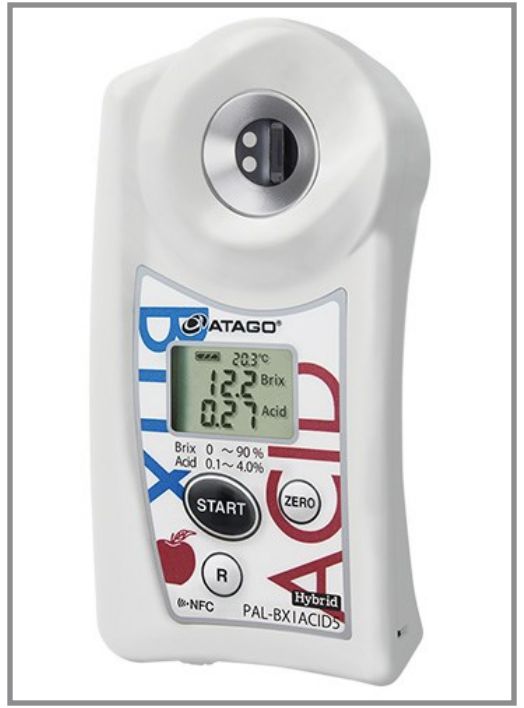
Figure 7. ATAGO pocket Brix-Acid meter determines total soluble solids and titratable acidity for apples.

A decrease in acidity indicates advancing maturity. Acidity