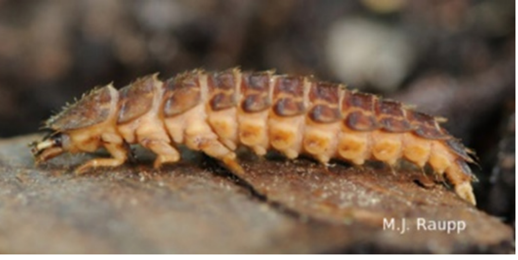
Glow-worms, larvae of fireflies, are predators that live in the soil and search for prey.

copulation, the male offers a nuptial gift of rich protein, which the female uses to provision the eggs that will soon start to develop in her ovaries. Click here to see a video of fireflies flashing and mating – watching insect behavior is really interesting. Interestingly, in one species of firefly, Photuris pensylvanica , the female mimics the flash pattern of another species, Photinis pyralis , to attract the male of the other species to her. When the male of the other species arrives thinking, he has found his mate - she eats it to obtain defensive compounds used to protect her eggs. A bad surprise for that male.