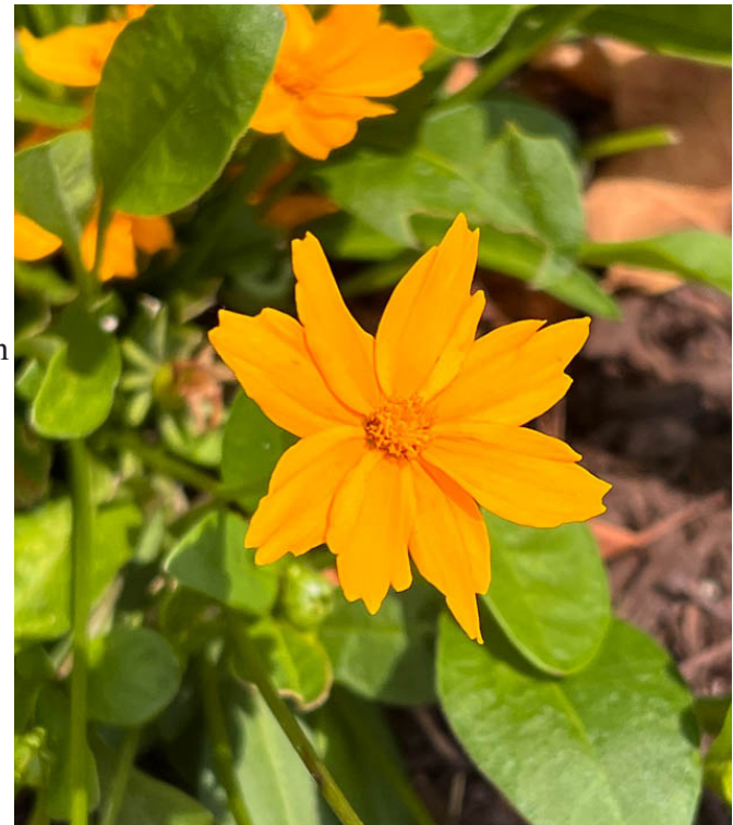
Coreopsis auriculata 'Nana'

Coreopsis auriculata 'Nana' is a wonderful but short-lived native evergreen perennial lasting about 3 years. It has 2 creative names, tickseed because the seed looks like a tick and mouse ear because the leaves look like they could belong to a mouse. These beautiful plants thrive in full sun and moist but well drained soils. They spread slowly by stolons, growing in a dense clump 6-9 inches tall and wide. Plants are cold tolerant in USDA zones 4-9, and are also tolerant of both heat and humidity. The leaves are dark green 1-2 inch long, growing in a dense clump with spoon shaped basal leaves that have a smooth margin. The golden yellow star shaped flowers grow 1-3 inches across with 7-20 ray petals that are notched with 3 lobes at the end, and surround a bright yellow center disk. Flowers can bloom from April to Jun on thin sturdy flower stalks that can grow up to 18 inches. If flowers are deadheaded, a second set of flowers can bloom in the summer into autumn. 'Nana' is the prefect size to plant in front of taller perennials in a mass or as a border. They can also be planted as an edger along walks or paths, or in a pollinator, butterfly, or cottage garden as they attract butterflies and other pollinators. There are no serious insect or disease problems, although 'Nana' is not as drought tolerant as other Coreopsis but does have resistance