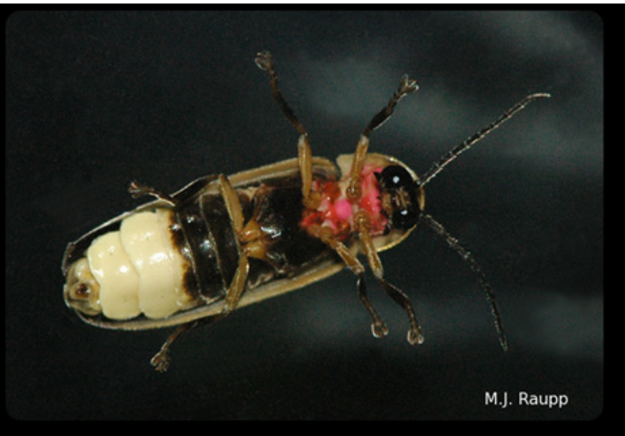
Underside view of an adult firefly showing the abdomen where the light organ is located (white segments). Photo: M.J. Raupp, UMD

of firefly and vary by sex within a species. The flashes that we see are from the males that are attempting to attract a mate. For example, males of the common eastern firefly (Photinus pyralis) flash every six seconds. Females watch the light "show" and if a display from a specific male is particularly attractive, she will flash a response but only if it is from the male of the same species. The male descends to that location to mate with her. In addition to transferring Photo: M.J. Raupp, UMD sperm to the female during