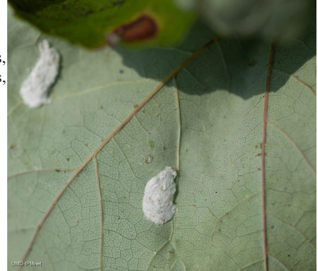
Cottony maple leaf scale is finishing up its crawler period as we move into July.

Control: Natural enemies usually keep this soft scale in check providing biological control. However, if honeydew/sooty mold is abundant, control measures may be warranted. For best control, target the crawler stage (recently hatched eggs) of the scale. Talus or Distance can be used.