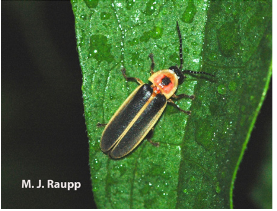
Lampyridae. There are over 2,200 known An adult of the common eastern firefly, Photinus pyralis . In this picture, the head is sticking out from underneath the shield-like projec-

species of fireflies, of which about 165 species have been reported in the U.S. and tion of the thorax. Canada. Fireflies are found in temperate