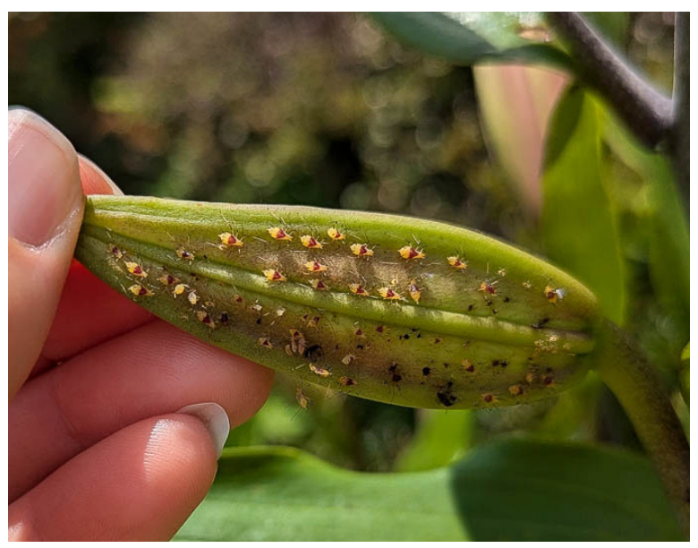
Note the distinct purple spot on these lily aphids.

Miri Talabac, UME-HGIC, found aphids on hybrid lilies this week in Laurel. This is the purplespotted lily aphid, Macrosiphum lilii. It is a relatively large, pale yellowish to yellowish-orange aphid with long, black antennae (except the bases); long, black cornicles (structures that resemble dual exhaust pipes on a hotrod); and black "knees" and "feet". The cauda ("tail") is the same pale color of the abdomen. A conspicuous, purple spot occurs on the top of the abdomen. On some specimens, the spot forms a triangle with an apex toward the head. This is one of the "coolest" aphids you will see. Unfortunately, it does damage hybrid lilies and should be controlled if populations build up. Endeavor insecticide is a good material that is an insect stylet blocker, which jams up the feeding of the aphid, which then dies of starvation.