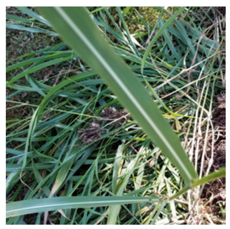
Photo 4: Shattercane Photo: Joseph M. DiTomaso, University of California - Davis, Bugwood.org <u>https://www.weedimages.org/browse/detail.</u> <u>cfm?imgnum=5386294#</u>