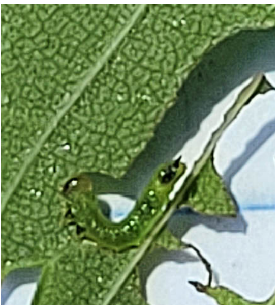
Elm zigzag sawfly larvae are active in MD.

The elm zigzag sawfly (Aproceros leucopoda) is another pest from China and Japan that has found its way to Maryland. In Europe, it has caused extensive damage with its multiple generations per year. We have yet to see how bad it will be for hybrid elms here in the United States. It can reproduce parthenogenically. More bad news - elm