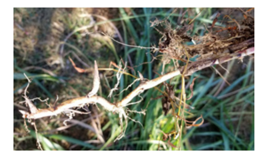
Johnsongrass has a dense rhizome Photos: Chuck Schuster, UME

The fuzzy collar of johnsongrass. Photo: Theodore Webster, USDA Agricultural Research Service, Bugwood.org <u>https://www.weedimages.org/browse/detail.</u> <u>cfm?imgnum=1556482</u>