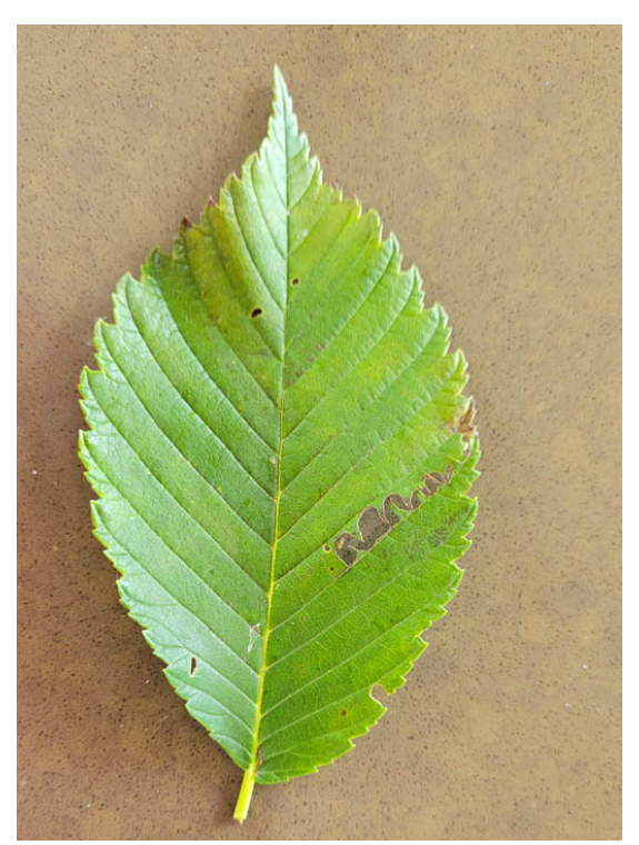
Views of elm zigzag sawfly damge on leaves.

Elm zigzag sawfly was first reported in North America in July of 2020 in Sainte-Martine Quebec, the pathway of introduction to North America as well as the amount of time it has been present is currently unknown. It was identified by citizen scientists on the application iNaturalist, and later confirmed by the Canadian Food Inspection Agency (CFIA). The EZS was first discovered in the US in 2021. It has since been spotted in five Eastern states, including North Carolina, Vermont, and Massachusetts.