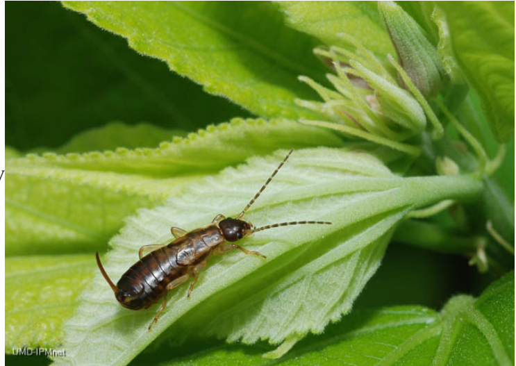
More reports than usual are coming into the UME-HGIC Ask Extension website this year. The photo is an earwig nymph.

Something about the spring weather has been