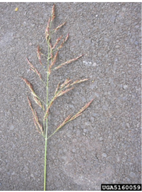
Johnsongrass seed head.

Shattercane can be easily confused with Johnsongrass. Both plant's seeds are similar in shape but Johnsongrass seeds are much smaller than shattercane seeds. The seed heads of both plants are also different. Johnsongrass has a more open panicle seed head while Shattercane has a tight cluster.