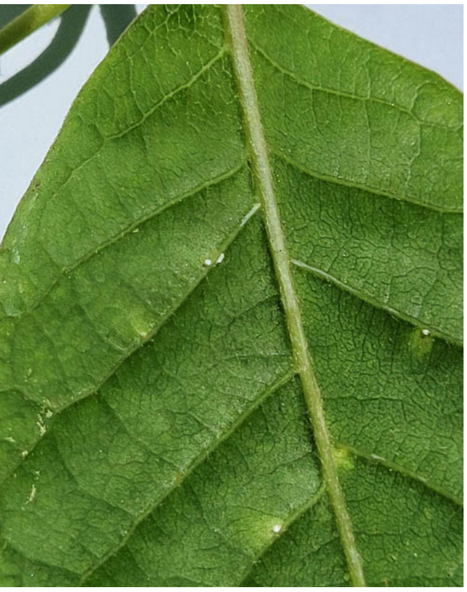
Monitor black gum trees closely for the armored scale, Chionaspis nyssae. It is found on tree trunks and foliage.