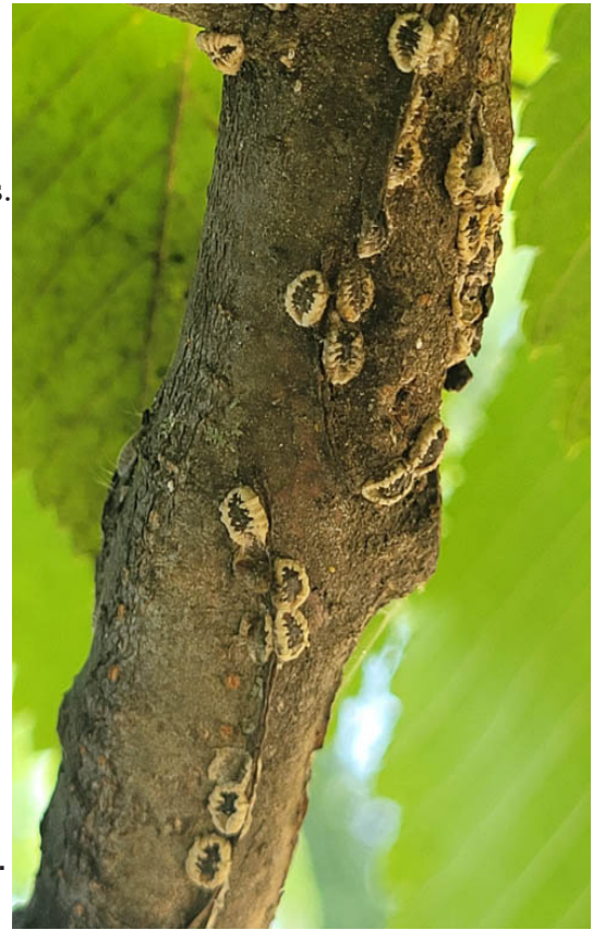
Look for crawlers of European elm scale through July.