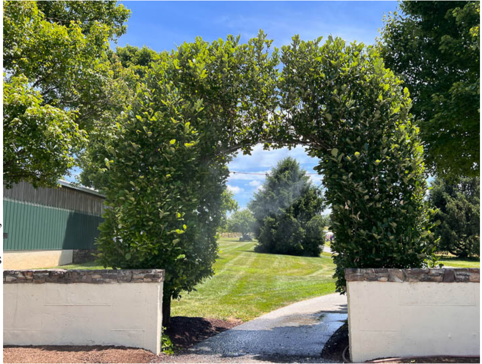
Two Quercus x warei 'Long' Regal Prince® formed a lovely arch along this walkway at Ruppert Nurseries.

lovely arch created by 2 stunning Quercus x warei 'Long' Regal Prince®! As much as I loved looking at all the lovely trees, the Tech Field Day introduced me to so many new ideas including drones that can take inventory by accurately counting trees in 50-foot sections, watching a large drone that is capable of carrying up to 200 pounds of liquid and able to pinpoint weeds to spray without damage to the plants beside the weeds, and much more! It is always a good day when you can mix beautiful plants with new technology.