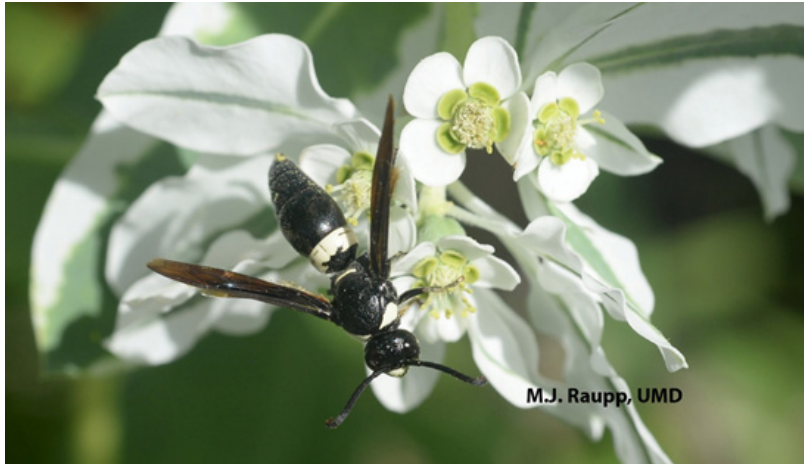
When not hunting caterpillars, four-toothed mason wasps, Monobia quadridens , can be found pollinating a variety of plants like snow-on-the-mountain.