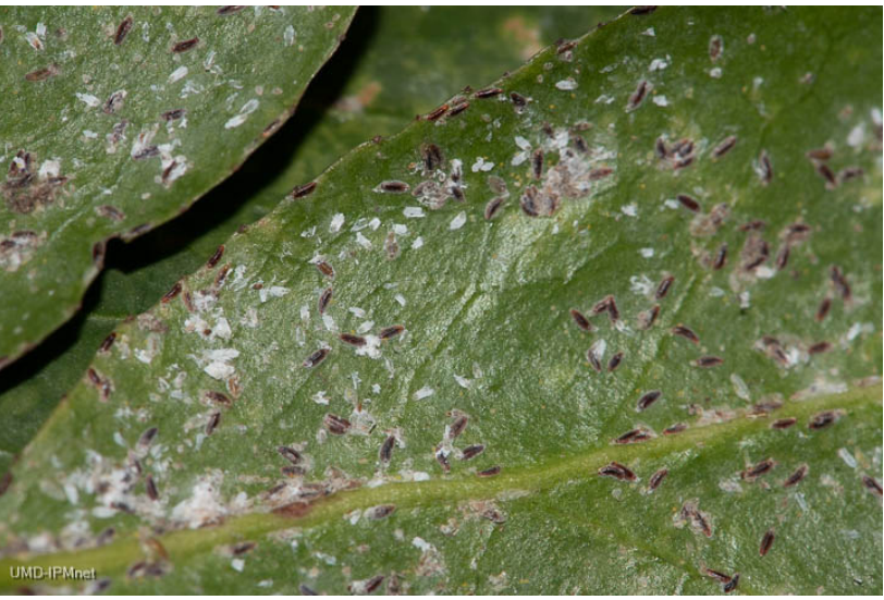
Tea scale on camellia.

With a growing interest in camellias, we expect to see more tea scale which prefers this plant. This insect has multiple overlapping generations per year (first generation crawler hatch at 195 DD) and will continue to reproduce during the growing season. If anyone has any suspected infestations of tea scale on their camellias, we are interested in getting a sample. Please contact Sheena O'Donnell at <u>sodonne5@umd.edu</u> if you are willing to part with some tea scale.