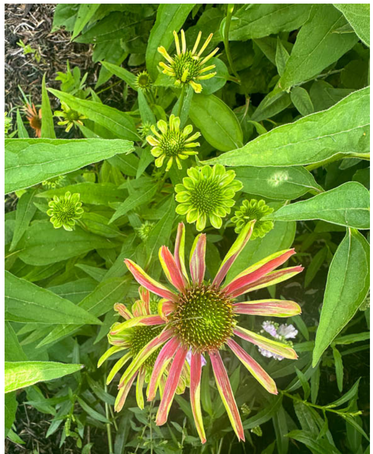
Echinacea flowers infected with aster yellows are deformed and have abnormal flower color (greenish-white).

Dave Freeman, Oaktree Property Care, sent in photos of Echinacea with abnormal flower development and color. Flowers symptoms include stunted greenishwhite ray flower petals, and often green leafy growths protruding from the blossom centers. This problem is caused by aster yellows which belongs to a group of plant pathogens that are called phytoplasmas. This group is related to bacterial pathogens however; their cells have flexible membranes and have no cell walls making them pleomorphic in shape. They are single celled and reproduce by fission like bacteria. They are intracellular parasites and are non-motile. They are spread through the plant inside the phloem. The aster vellows pathogen is spread to ornamentals by phloemfeeding leafhoppers, primarily the aster leafhopper, Macrosteles quadrilineatus formerly fascifrons. Aster yellows can infect over 300 species of woody and herbaceous ornamentals, vegetables and weeds in 38 plant families as well as a number of grain crops. This phytoplasma is transmitted when infected leafhoppers feed on the phloem of an infected plant such as a weed host. Leafhoppers acquire the pathogen, but there is an incubation period, sometimes referred to as a latent period, which may take 2-3 weeks, where the pathogen multiplies within the leafhopper, and then moves to the salivary glands. Only then is the leafhopper capable of transmitting the pathogen to another plant. After feeding, it can take 10 days to 3 weeks, depending on