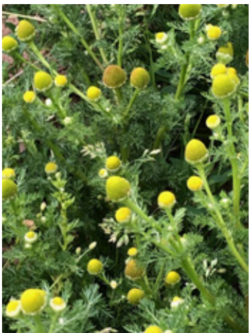
Pineapple weed

Pineapple-weed, Matricaria discoidea , is a summer annual that is found in turf, landscape and nursery settings throughout the United States. This weed has leaves without hairs that are finely divided into narrow segments, are alternate, arising from stems attached to the taproot. When crushed the plants emits a pineapple like odor, one of the reasons it has the common name. Yellow to greenish yellow cone shaped flowers will be produced on the ends of short peduncles (flower stems) and are between one quarter and one half inch in diameter. The petals of the flower are very hard to distinguish. Stems will be hairless, and grow up to sixteen inches in total height. Pineapple-weed reproduces through seed. This plant is very similar to Mayweed chamomile or dogfennel, yet neither of these species emits the pineapple like odor when the plant is crushed.