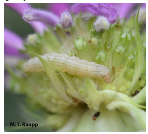
A close-up of the raspberry pyrausta caterpillar feeding in a flower bud of Monarda . Note the chewing damage to the flower and the black fecal pellets – diagnostic signs of this pest.

The four-toothed mason wasps provide dual ecosystem services. In addition to providing biological control of caterpillars, the four-toothed mason wasps are also great pollinators as they seek out nectar to power their hunt for prey, and pollen as a protein source needed to make eggs. While foraging in the flowers, they end up being good pollinators.