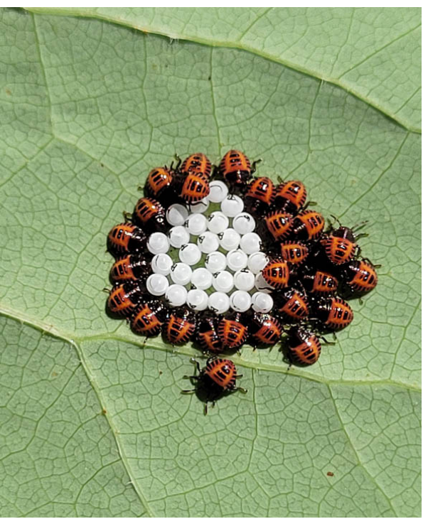
First instar brown marmorated stink bugs.