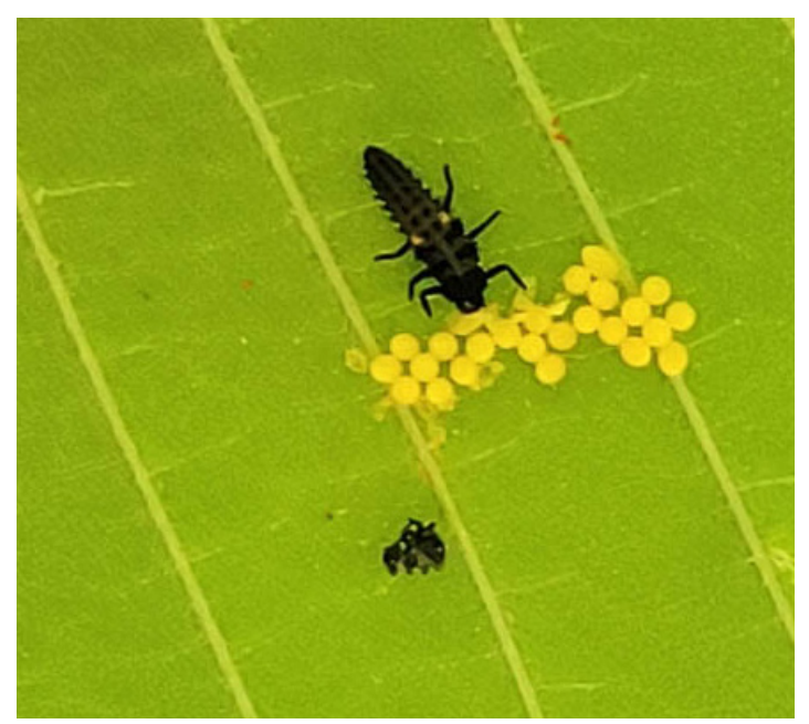
A lady beetle larva is feeding on a cluster of eggs before they hatch.