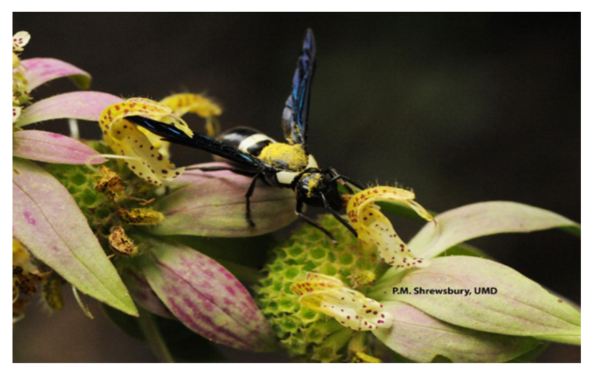
The four-toothed mason wasp, Monobia quadridens, covered in pollen as it feeds on nectar and pollen resources from this Monarda punctata.