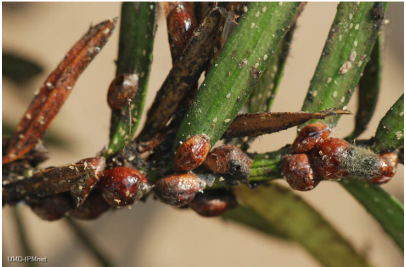
Fletcher scale is producing crawlers now. Look for crawlers into July.

Fletcher scale was found on Thuja 'Green Giant' this week. Crawlers are active from mid June into mid July. This soft scale is commonly found on arborvitae and yews. We are seeing more often now on 'Green Giant' arborvitaein landscapes and nurseries. If you are seeing it in the landscape on arborvitaes, please let us know (sgill@umd.edu). This scale produces a lot of honeydew and causes yellowing on plant foliage. Use Talus or Distance for crawlers.