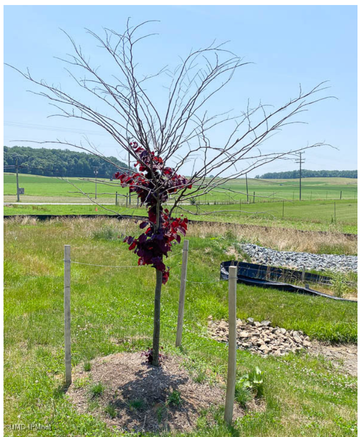
Come attend an evening program on diagnosing plant problems.

Licensed Tree Expert, International Society of Arboriculture