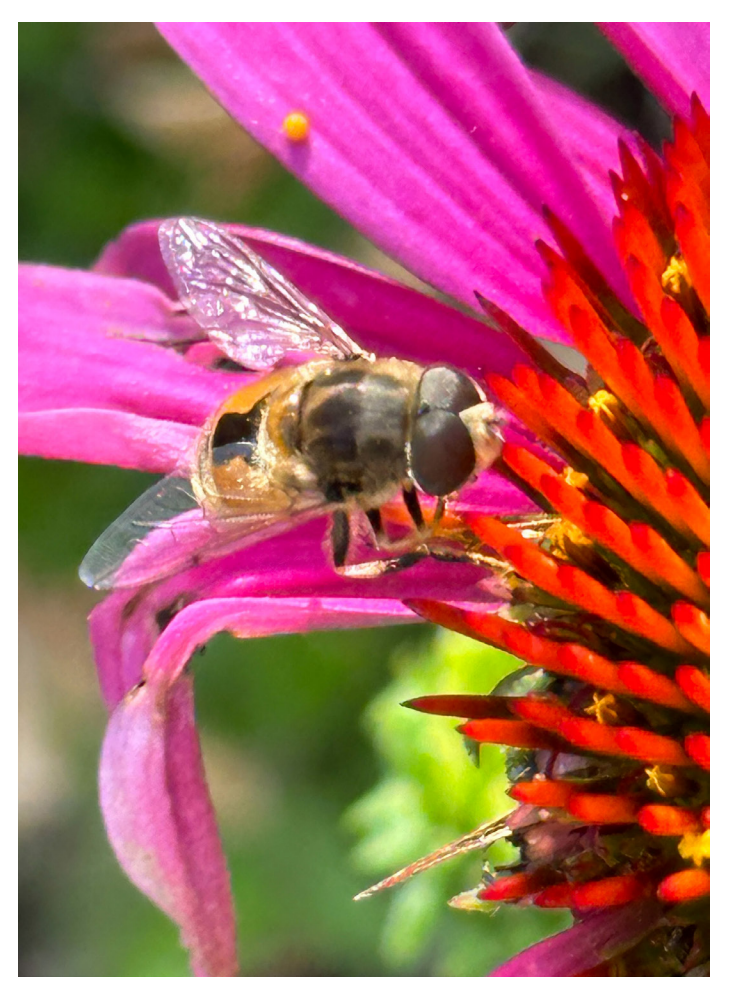
The larvae of syrphid flies feed on small insects.