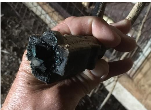
Figure 5. Without proper precautions, moisture can damage electrical cords

be energized (use electrical meter to check). Replace any plug that shows signs of being charred, melted, or overheated.