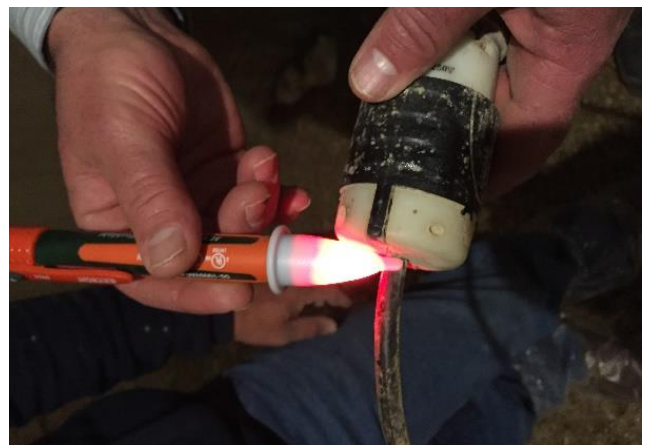
Figure 1. Use a voltage tester to determine presence or absence of electric voltage

breaker (the wrong switch may have been turned off). Every farmer should have a voltage meter (figure 1). They range from simple, inexpensive units that only indicate if electricity is present, to more expensive ones that can measure electrical current.