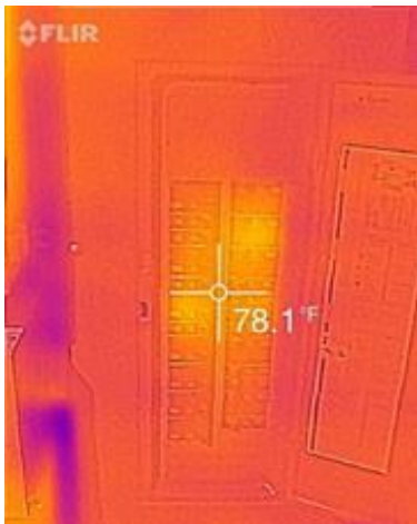
Figure 2. A thermal imaging camera can be used to evaluate safety of electrical systems

boxes, resulting in overheating and fires. You can use a thermal camera to identify problems in the panel that need to be corrected (figure 2).