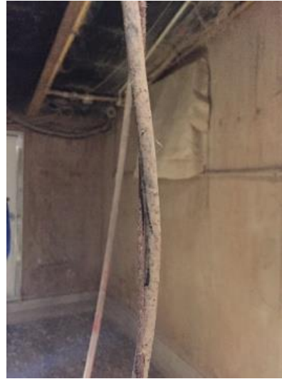
Figure 3. Keep electrical cords free of cables, which can damage cord insulation

Do not wrap electrical cords around motors since this can damage the cord insulation when the motor heats up during use. It can also damage the insulation around the cord due to vibration of the motor.