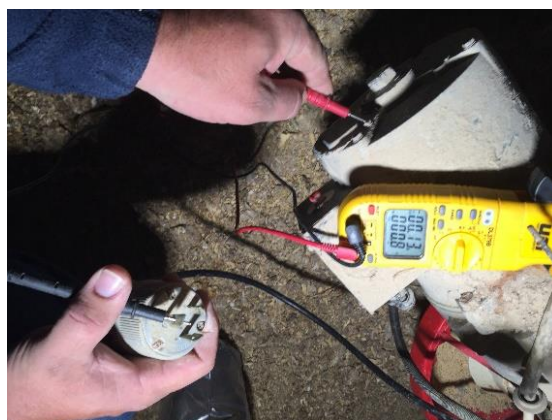
Figure 6. Use a tester to determine if there is an electrical problem with a motor

Note: The use of commercial names does not represent an endorsement by the authors or the University of Maryland Extension.