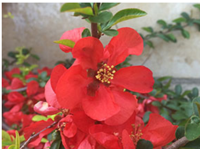
Look for the new cultivars of flowering quince; some will also have double blooms