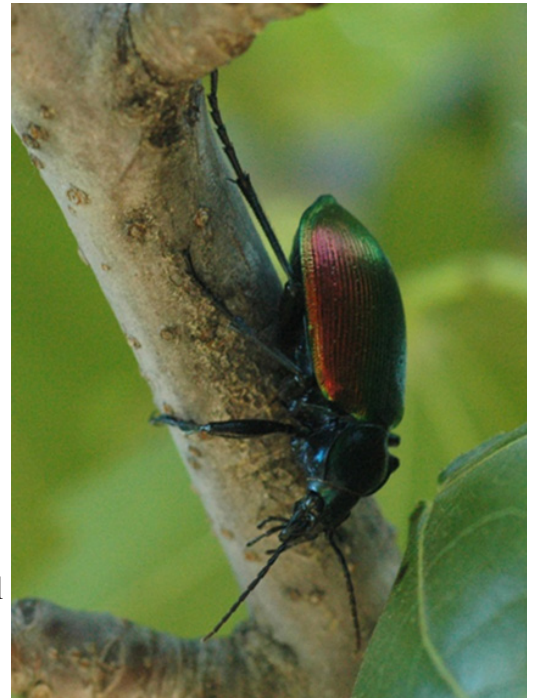
The fiery searcher or caterpillar hunter, Calosoma scrutator , is one of the largest carabid or ground beetles growing to 1.5" long, is one of the few ground beetle species that are arboreal, and it has a particular fondness for caterpillars.

The fiery searcher is a common predator in ornamental and turfgrass systems in addition to woods and fields. They climb up trees to find prey such as cankerworms, eastern tent caterpillars, and gypsy moth caterpillars. You should start to see these large predators around this time of year. Fiery searchers are active from about late April to November and are often found under rocks, logs, bark, leaf litter, and decomposing logs when they are not foraging in trees. Eggs are laid in the soil and both the larvae and adults climb trees in search of