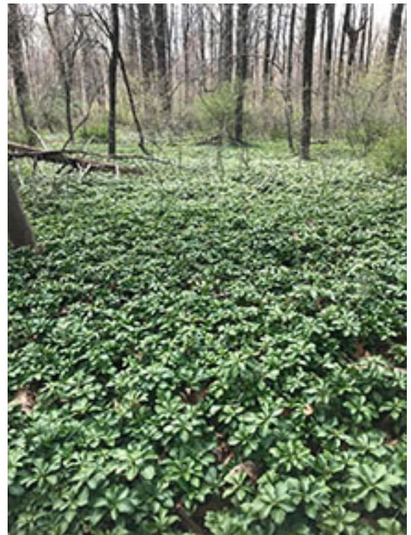
Japanese spurge is a landscape plant that has become invasive in natural areas

Clients often want quick, evergreen groundcovers, but invasive plants have unintended consequences in our natural ecosystems. This is an opportunity to turn to other choices that are unique, beautiful, non-invasive, and adapted to Maryland’s growing conditions. Some alternative groundcovers include: ferns – Christmas fern ( Polystichum acrostichoides ) and marginal woodfern ( Dryopteris marginalis ), sedges – blue wood sedge ( Carex glaucoidea ) and Pennsylvania sedge ( Carex pennsylvanica ), Canadian ginger ( Asarum canadense ), golden groundsel ( Packera aurea ), and creeping phlox ( Phlox stolonifera ). See additional choices listed here: https://extension.umd.edu/hgic/topics/groundcover-list .