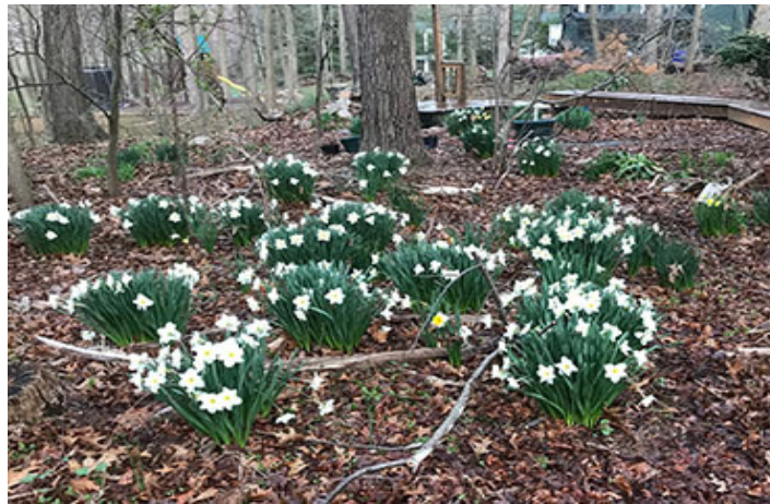
Floral displays of daffodils and peaches are looking good this year