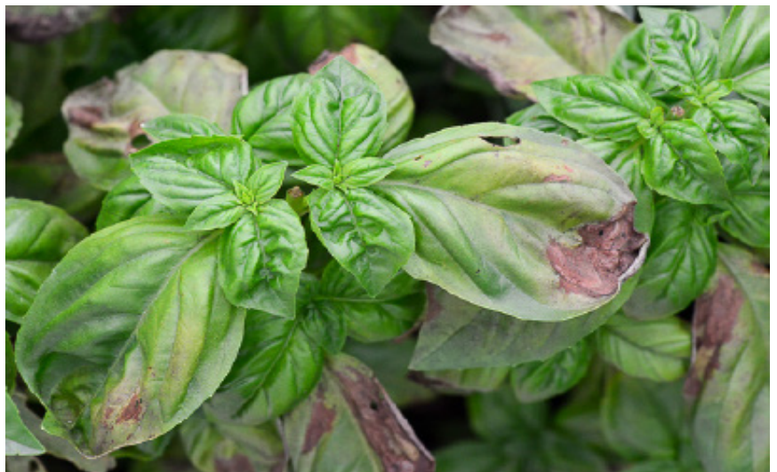
Resistant cultivars are being bred because downy mildew is a serious problem on basil

Three years ago we brought in a Rutgers's University pathologist to speak to Maryland greenhouse growers. He mentioned that he was working on downy mildew resistant basil varieties and was close to market. Rutgers has released two cultivars: 'Obsession' and 'Devotion' (great names). 'Obsession' is a compact basil with good resistance to downy mildew. 'Devotion' is also downy mildew resistant but is a bigger plant than 'Obsession'. On another front, Israeli plant breeders have released 'Prospera' as a downy mildew resistant basil. I found Seedco and Johnny's Seed as suppliers in a web search.