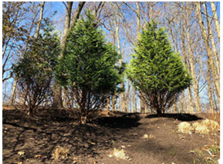
Deer browsing on Thuja 'Green Giant' is occurring this spring