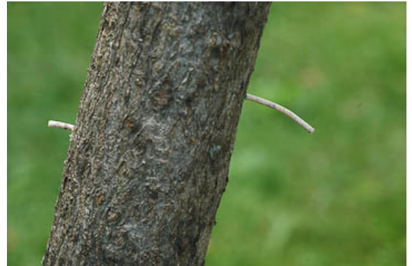
Frass tubes indicate ambrosia beetles are infestation

We sent out the special report on Monday reporting flight activity of Xylosandrus species in central Maryland. They continued to show up in our baited traps through the week. We had seven Xylosandrus germanus and two Xylosandrus crassiusculus on Thursday morning. Samples from James Becker in Frederick were negative for Xylosandrus activity. These were collected early in the week of April 8. The cooler weather in western Maryland is probably delaying flight.