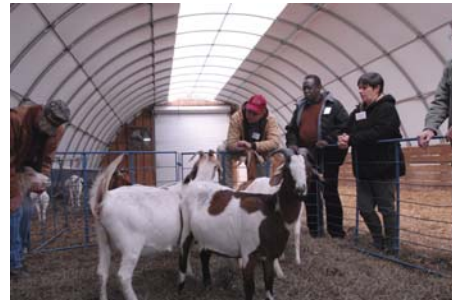
Participants at the Sheep and Goat Workshop watch a hoof trimming demonstration.