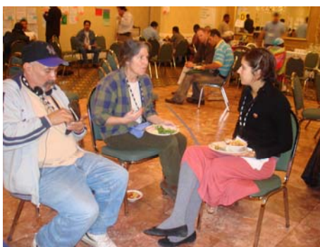
First NIFI Conference in Las Cruces, NM

Initiative (NIFI) are to be encouraged and supported. In fact, recent U.S. population trends (indicating more diverse and multicultural population) has spurred a new phenomenon known as the new face of the U.S. agriculture dominated by U.S. immigrant farmers. This growing wave of “new” farmers is eager to grow and supply unusual crops sometimes known as ethnic and specialty vegetables. Needless to say, new immigrants are interested in farming, but they do not know how and where to begin. For the first time, a national conference on immigrant farming was organized in Las Cruces, NM on February 2007.