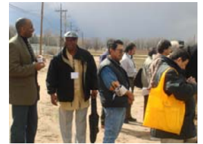
MD & CA Farmers at NIFI Conference in Las Cruces, NM