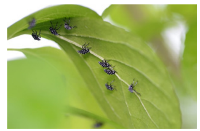
First instar nymphs are black with white spots and can be quite active (jumping, walking, feeding).

Cornus kousa as a Cut Woody Flowering Plant By: Stanton Gill