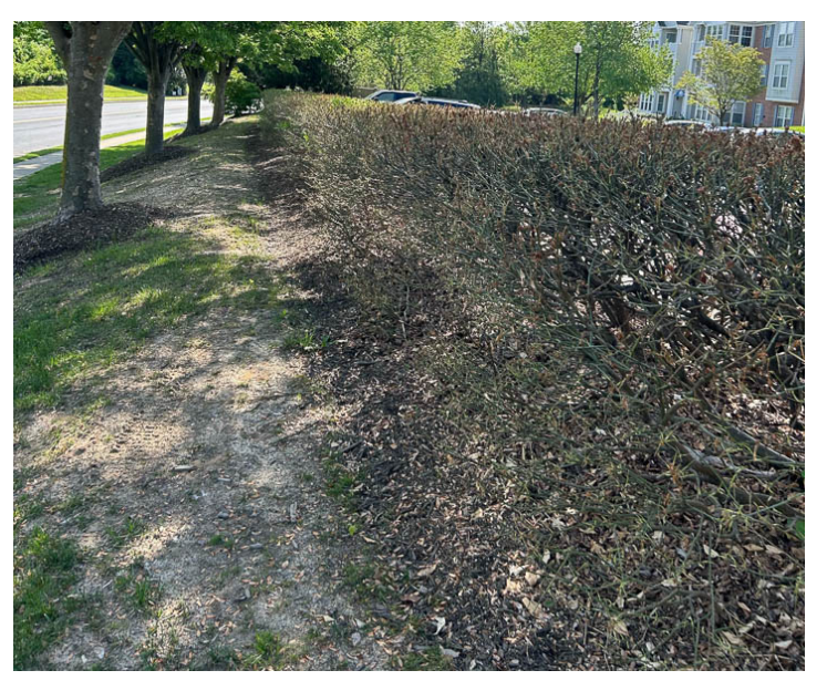
Euonymus leaf-notcher caterpillars have defoliated this euonymus hedge. It is early in the season and the plants will leaf out again.