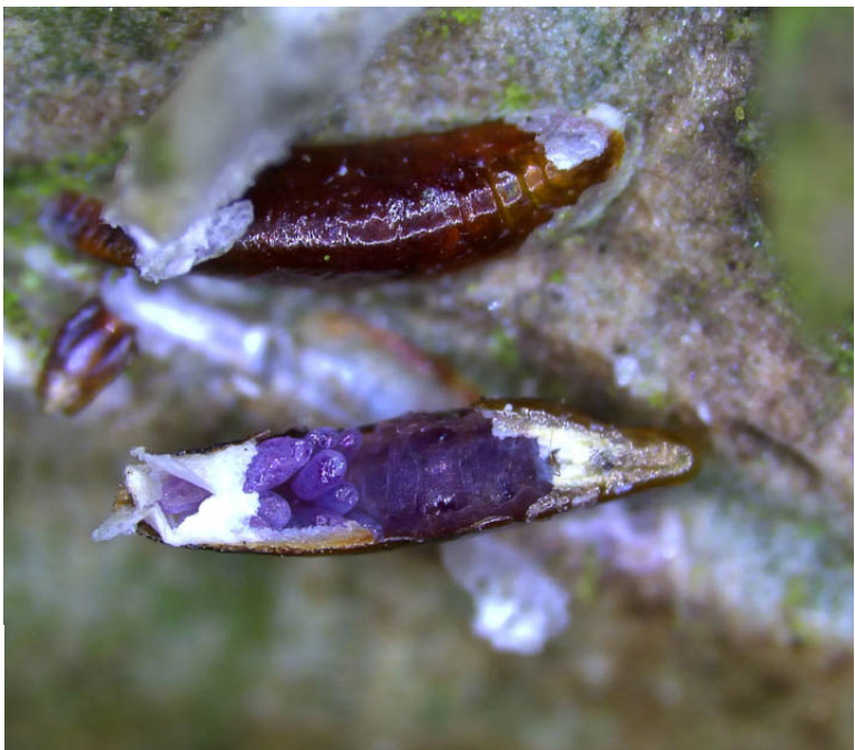
Japanese maple scale is another species to monitor closely later this month into June for egg hatch.

In Baltimore County and Gaithersburg, Heather Zindash is finding eggs under female covers of Japanese maple scale. This scale has an extensive host range. It also blends easily into the bark of trees so monitor plants closely. The first generation egg hatch for JMS occurs in June. Degree day totals for egg hatch is around 829. Wait until crawlers are active to apply either Talus or Distance.