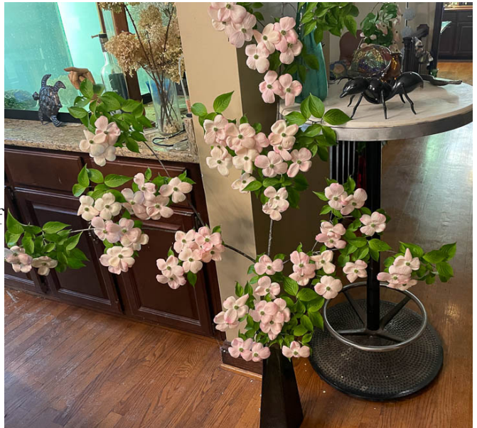
We cut pink dogwood and it is holding for over 3 days in a vase. It makes a great floral display.

My youngest daughter is getting married on May 18, so we were searching for flowering plants that could be used in flower arrangements. So far, 'White Knight' fringe tree flowers look perfect. We have several cultivars of hybrid Cornus kousa and Cornus florida on the farm. We cut 3 ft branches off one of the cultivars which was in full bract/bloom and put it in a large upright vase. It made a spectacular flat branch display. We cut it on May 3, and as of May 6, it is still looking great. We have 5 different cultivars of Cornus hybrids which open their bracts/flowers over the next couple of weeks, so this has potential for a fairly long time to harvest good-looking branches in May. Some of you may have already experimented with cut Cornus branches. If so, you are ahead of the game. For the rest, this might be something you want to try out.