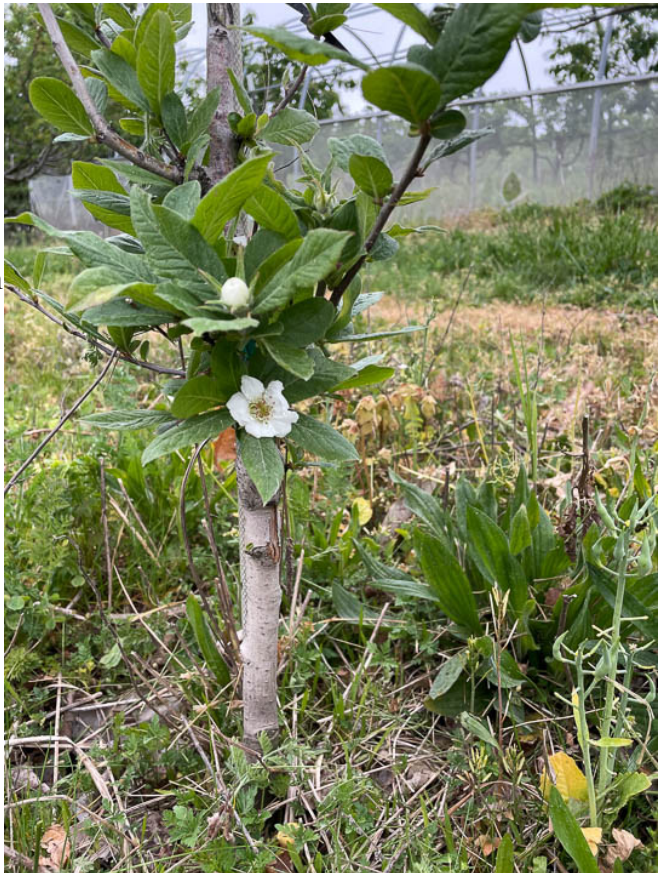
It took three years to get this Medlar to bloom.

Under ideal circumstances, the plant grows up to 8 meters (26 feet) tall. Mature trees are rather globe-shaped and rather pleasant looking. I am growing this fruit not only to investigate if it is a viable candidate for the nursery industry, but also to see what pests might attack it. Generally, it is shorter and more shrub-like than tree-like. It has a lifespan of 30–60 years. It took my plants three years to come into flower, and it is one slow grower. The reddish-brown fruit is a pome.