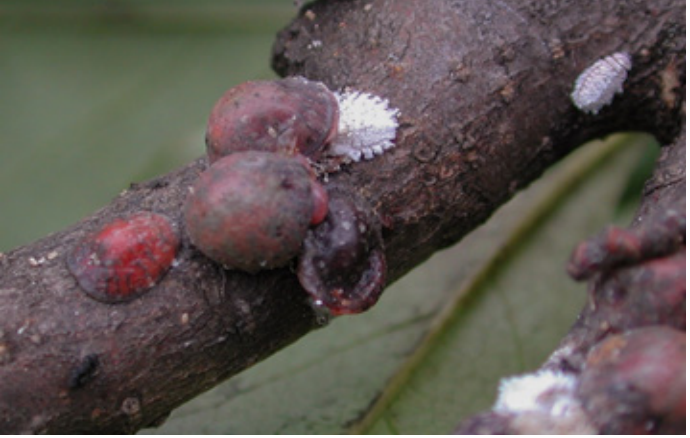
White waxy Hyperaspis larva has worked its way under a female soft scale and is snacking on her eggs.