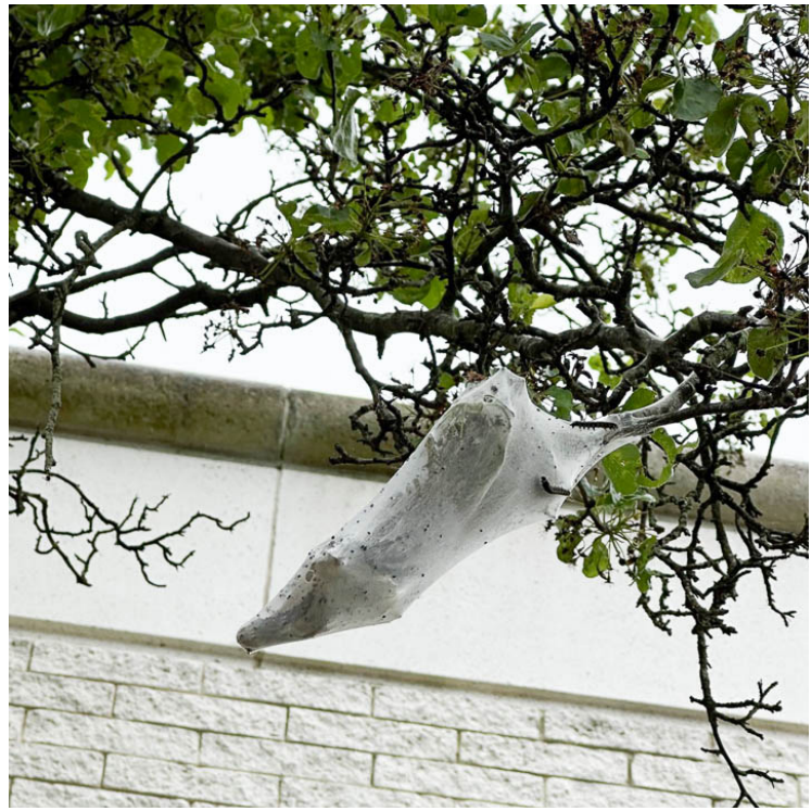
Eastern tent caterpillars are most often forming tents in the crotch angles and not on the tip of branches.

David Freeman, Oaktree Property Care, found a little unusual activity from what looks to be eastern tent caterpillar on callery pear in Fredericksburg, VA. Fall webworm caterpillars are the ones which web the ends of branches, but it is too early in the season for the activity. These caterpillars are forming the tent on the end of branches instead of in the crotch angle of a branch. Eastern tent caterpillars are finishing their feeding at this point and are looking for places to pupate.