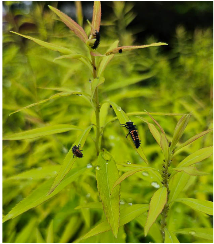
Lady beetle larvae are feeding on spirea aphids. Luke also found a lot of aphids on hellebores in Baltimore County.