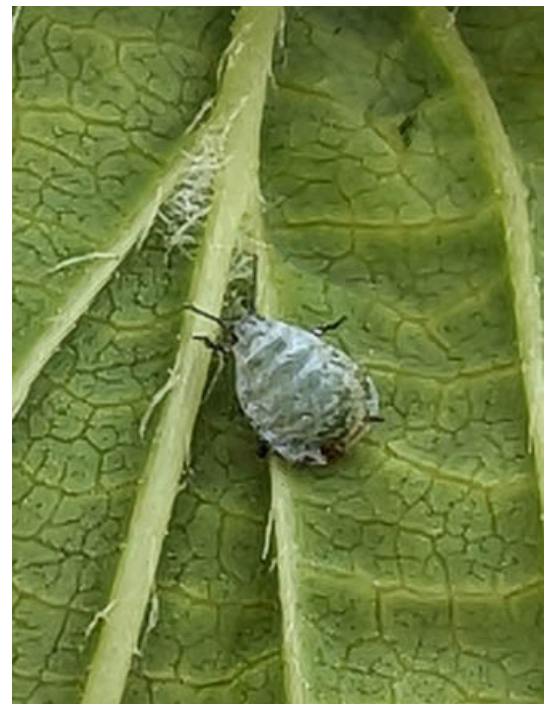
This aphid is damaging viburnums this spring.