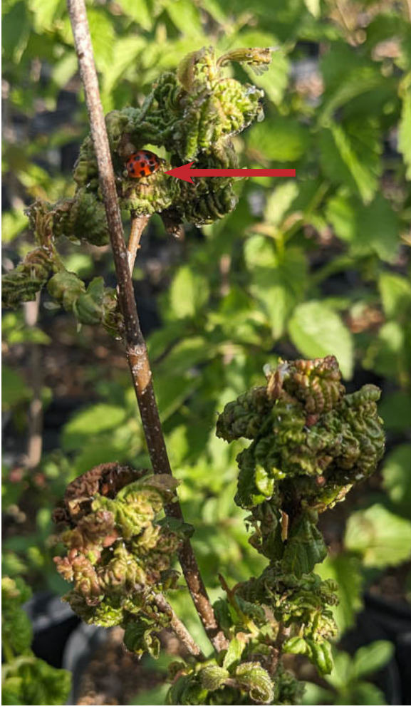
An adult lady beetle is feeding on these aphids.

We are getting regular reports of aphids this spring. They are being found on a wide variety of plants including hellebores, birches, spirea, crape myrtle, and viburnums. Jay Ludwig is finding aphids on arrowood viburnums that have been challenging to control. The likely species is snowball aphid ( Ceruraphis viburnicola ). He is also reporting spiny witchhazel gall aphids on river birch. Altus can be used for aphid control with minimal impact on beneficials. Endeavor is another option. It is a stylet blocker and does not impact benficials. Along with the aphids (and scale insects, caterpillars, and mealybugs) are a wide variety of predators. Often in the spring, populations of aphids on plants in the landscape are brought down by activity of predators and parasitoids and controls are not necessary.