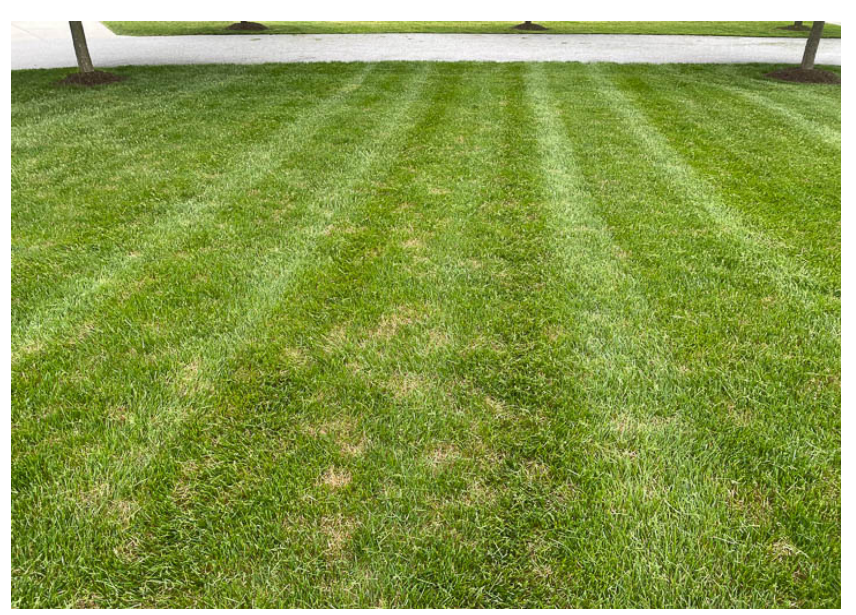
Damaged areas in turf with infections of red thread.