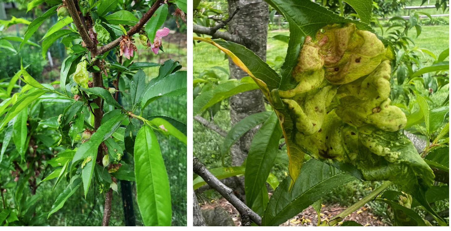
Peach leaf curl infection and start of plum curculio damage on fruit.

We continue to get reports of plum curculio activity and peach leaf curl infection. There is a <u>Penn State Fact</u> <u>Sheet</u> with more inforation on the life cycle and control of plum curculio. It is not the right time of year to treat for peach leaf curl.