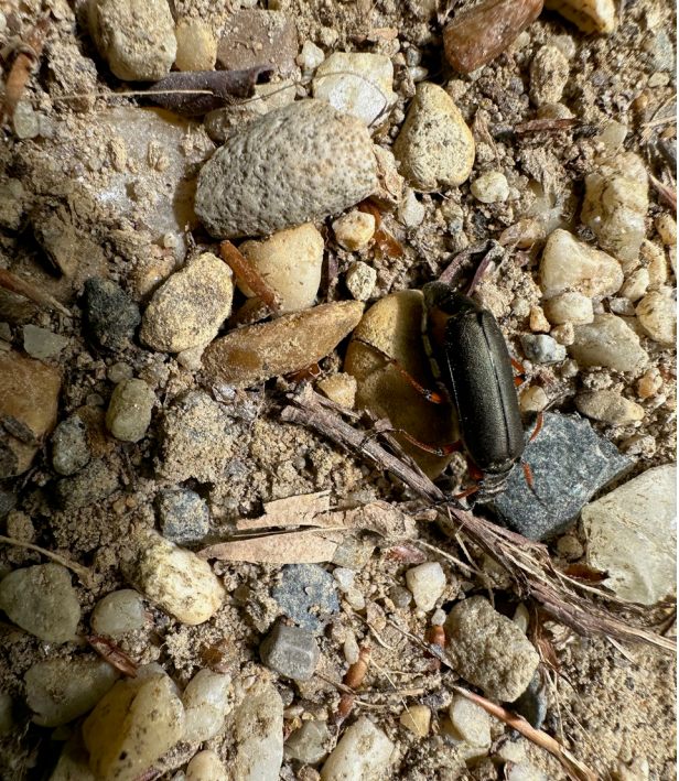
Blister beetles are seen in landscapes throughout the season.