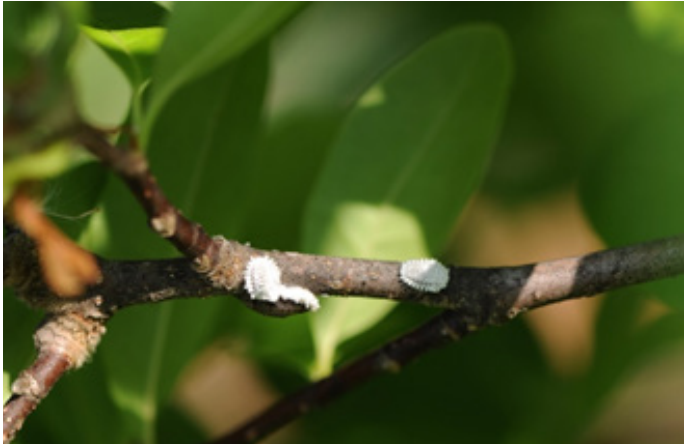
White, wax covered larvae of a Hyperaspis lady beetle foraging on scale nymphs settled along the branches.

Hyperaspis larvae can help in monitoring for soft scales. Their white color makes them very noticeable. If you see the white waxy lady beetle larvae on your plants, look closer to see if you have soft scale too. If you do, consider not applying pesticides and letting these predators do there thing. If the soft scale population is high and producing abundant honeydew you may want to treat the scale with a product that is easy on natural enemies, and consider treating in the winter with an oil spray. This will reduce the scales and conserve the predators so they can keep the scale populations down.