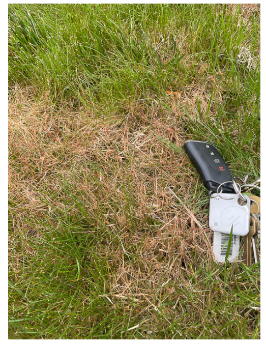
Red thread and pink patch infections in turf.

Mark Schlossberg, ProLawn Plus, Inc., is reporting that red thread and pink patch infections are very prevalent all over the area this week. Dan Barcikowski is also finding red thread infection in lawns. Pink patch disease is often found along with the development of red thread disease in turf. Cool, wet weather provides optimal conditions for disease development. Both diseases are more a problem in low fertility turf areas. Supplying N-fertility during infection periods may help to alleviate some of the symptoms, but keep in mind that that these turf diseases are very persistent in the spring months. See the <u>UMD Red Thread and Pink Patch Fact Sheet</u> by Dr. Peter Dernoeden for control options and more information.