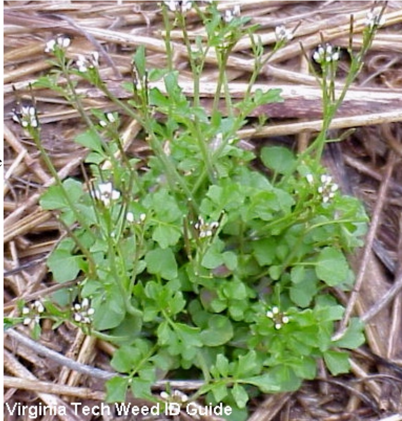
Hairy bittercess in flower.

Hairy bittercress is best controlled by maintaining a healthy, dense turf that can compete and prevent weed establishment. It grows best in a cool, moist environment, and often when a turf manager is mowing their lawn too short. In addition, prior to seeking the use of pesticides, you can employ hand pulling if it is feasible, especially before establishment and infestation of the weed gets out of hand. If chemical control is necessary, you have the choice between a preemergent applied in late summer/early fall, or spot treating seedlings in the spring with a postemergent. Look for a product with one or more of the following ingredients: 2, 4-D, MCPP (mecoprop), Dicamba* or Triclopyr.