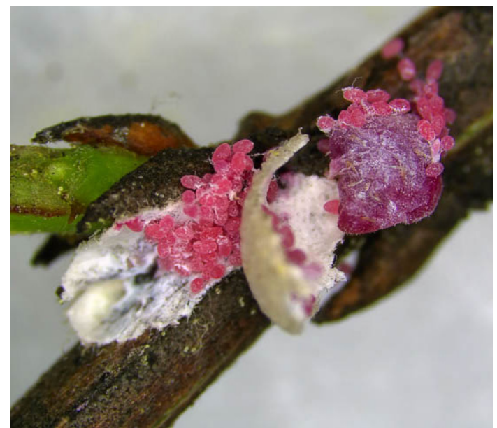
Female crapemyrtle bark scale covers flipped over to show eggs underneath. Egg hatch is likely in this area later this month.

The Hyperaspsis lady beetle larva is feeding among a good population of crapemyrtle bark scale.