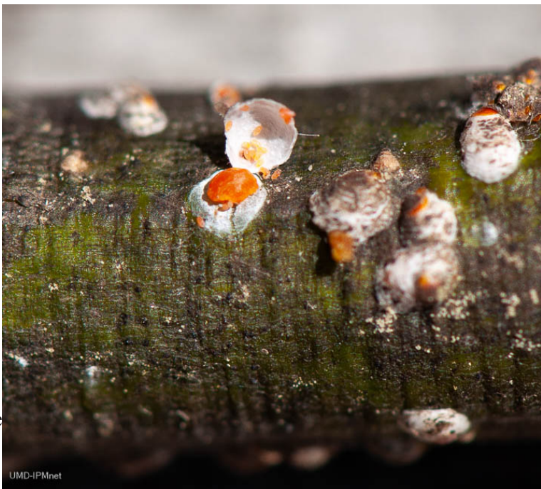
Female white prunicola scale cover removed to show female body and some eggs underneath.

At crawler activity time, you will find the most predators and parasites active. For this reason, we usually recommend using Talus or Distance insect growth regulators at this stage of development. Some landscapers have used Azadiracthin, such as Molt-X or Aza-Direct, acting as an insect growth regulator, with several managers reporting good success.