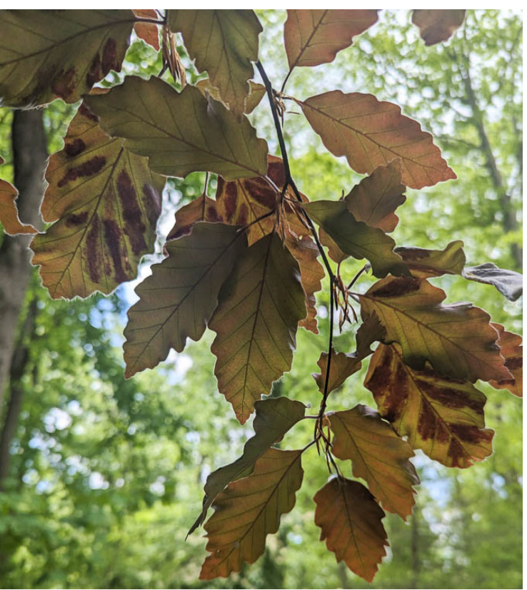
Copper beech with beech leaf disease found in Wynnewood, PA.

The UME Home and Garden Information Center received a few pictures of beech leaf disease in Harford County and noted that the county now has multiple positive cases.