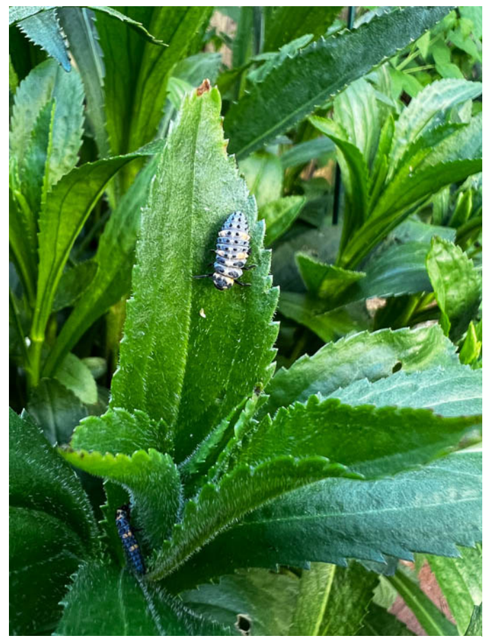
Lady beetle pupa and larvae found on Leucanthemum x superbum