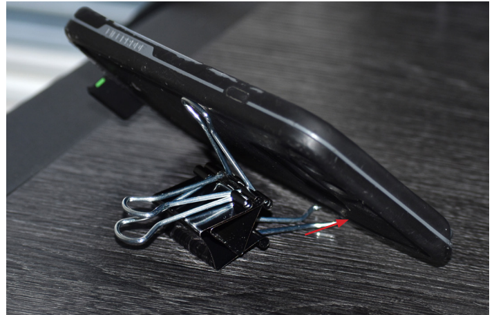
Two bulldog clips interconnected and one tip under the phone bent up works well as an inexpensive tripod.